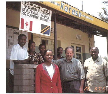
Left: CHES House in Katesh

The third use of the grant money is focused on the grads who leave school at the end of Form four and who seldom have the resources to acquire further training, thus entering the job market. By the time our agents left Katesh at the end of August, they had interviewed more than forty young women, purchased a dozen sewing machines and started a sewing school in CHES house (now referred to as the CHES Training Centre). They had signed 15 girls up for various levels of computer training, issued seed money to several others to start their own business, paid for others to attend Teacher's College or other training centres and expanded the secretarial services offered by the CHES office thus increasing business and decreasing overhead.